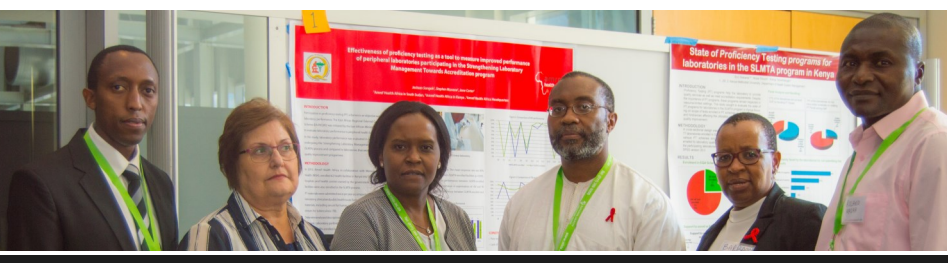
SLIPTA/SLMTA Symposium at ASLM2016, Cape Town