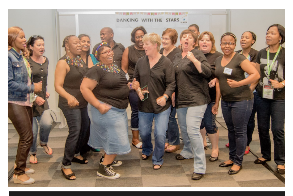
"Shosholoza " - South Africa showcasing their SLMTA Spirit with an invigorating song and dance